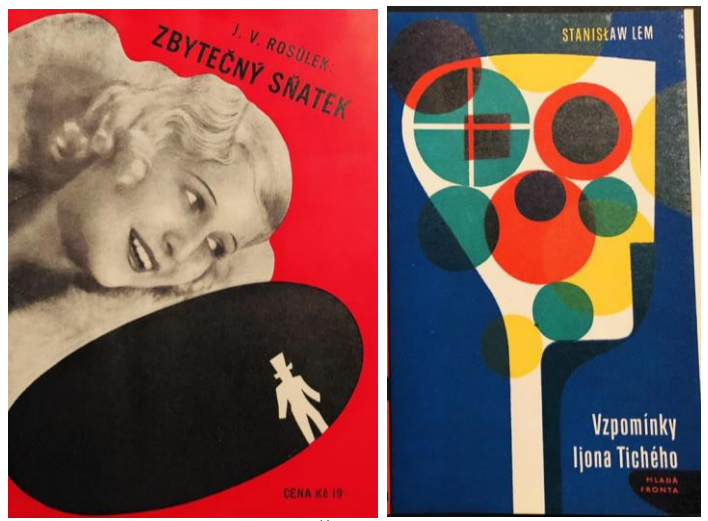
Two examples of Šváb-designed volumes.

In the fall of 2021, this was supplemented by the purchase of some sixty-six printed books that Šváb designed, dating from 1929-1967. Searching the list against the OCLC database revealed only three duplicates.